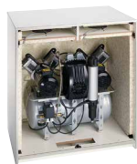
Soundproof cabinet, large