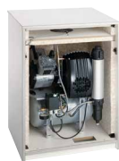
Soundproof cabinet, small